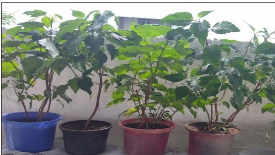
Photo 1: Photograph of Young P. Cablin collected from study area for pot culture studies

Several wild plants have shown their unique capability to selectively bio-accumulate heavy metals from contaminated soil in their underground and aerial parts in varying proportions. Due to the excellent adaptation to harsh climatic conditions, several locally, abundantly and robustly growing wild plants and grasses with considerable phytoremediation potentials for heavy metals, have found wide applications for cleanup of heavy metal contaminated soils [1, 3]. A wild and abundantly growing evergreen perennial plant Pogostemon cablin was selected for metal uptake and phytoextraction studies. This study was focused to evaluate the metal bioaccumulation ability of Pogostemon cablin growing on a heavy traffic zone of Laltappar industrial area along the Raiwala- Dehradun National Highways for Cd, Cr, Cu, Ni and Pb by analyzing the levels of studied heavy metals in soil, roots and shoots of the plant and thereby the assessment of phytoextraction ability of P. cablin for studied metals was computed in terms of the various BCFs (bio-concentration factors), TFs (translocation factors) and BAFs (biological accumulation coefficients) [10-13].