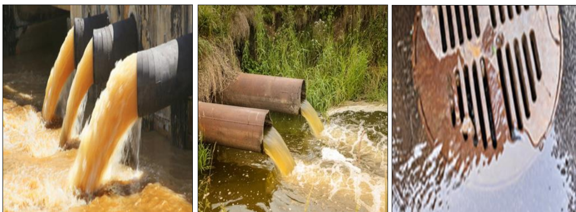
Fig 1: (a) Domestic waste water (b) industrial waste water (c) Stormwater Run off Waste water

[1] . WW is generally divided into two categories: black water and gray water. Black water refers to toilet waste and gray water refers to the remaining wastewater from sinks, showers, laundry, etc. The amount of waste water coming from house varies according to the hours of the day, days and seasons [2, 3] .